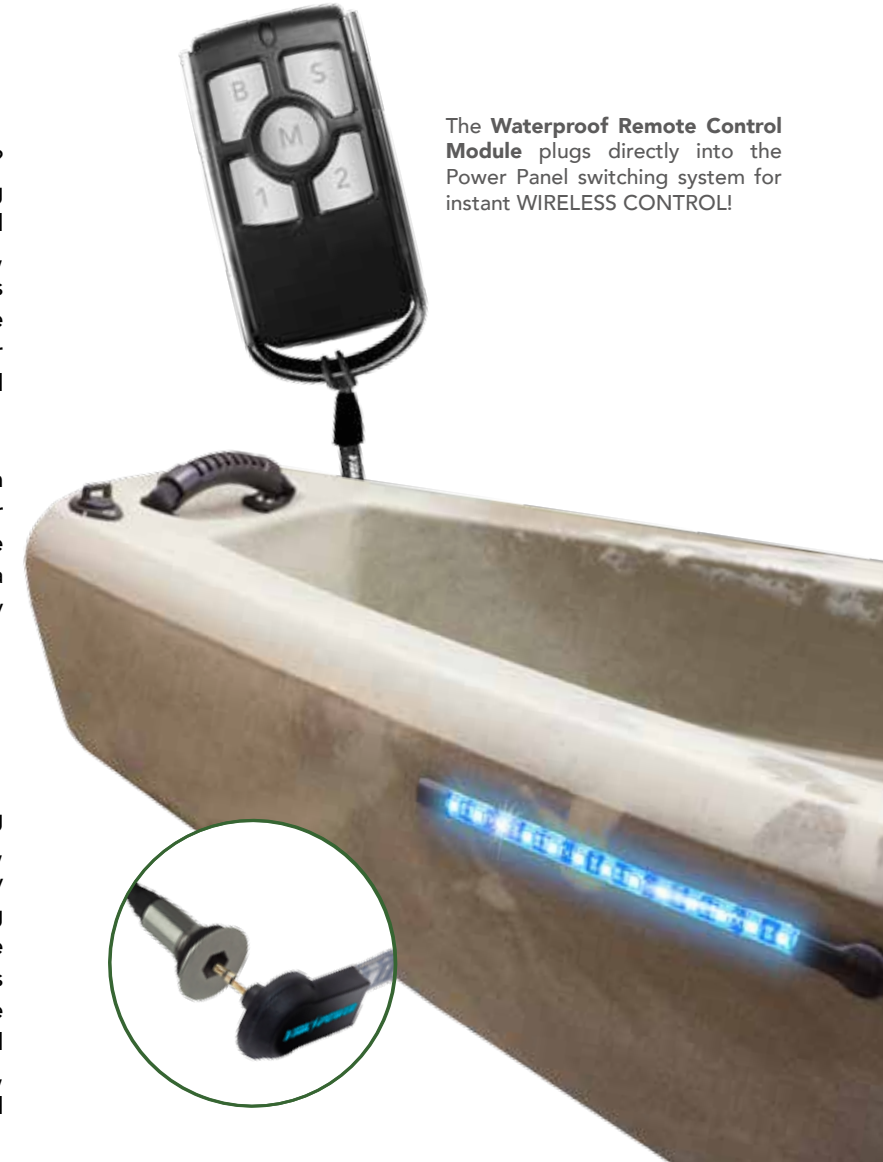
The Waterproof Remote Control Module plugs directly into the Power Panel switching system for instant WIRELESS CONTROL!