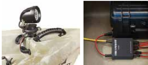
The Power Plug Accessory Connector allows you to easily connect most 12v accessories to the Yak-Power system.