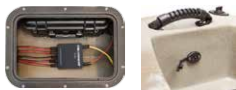
The Power Port 12v Outlet is your quick and easy way to add a 12v power outlet to your kayak.

The new Power Panel switching system is designed to make it quick and easy for you to add and control 12v electronics on your kayak. With 5 switched outlets, you can connect your fish finder, bait well pump, LED lighting, phone charger, and any other 12v accessory you need out on the water. All accessories are connected and controlled independently using individual buttons on the control panel. Each button turns RED when it is activated making it easy to see which buttons are in use. And, the Master Power switch allows you to completely power up-down the entire system with the press of a button to minimize your power consumption while out on the water.